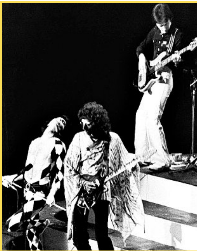
THE REAL THING: Queen Lead Singer Freddie Mercury, guitarist Brian May and bassist John Deacon during a concert in 1978.